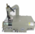
Leather Skiving Machine