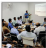
Training & Technical Assistants