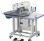
Automatic Sewing Machine