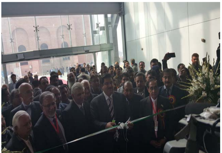
(Honourable Federal Commerce Minister inaugurating the Show on 28.01.2016)

The Honourable Federal Commerce Minister has announced finally the formation of " Leather Export Promotion Council – LEPC " in Pakistan, which would be real autonomous platform for addressing & resolving Leather Sector issues promptly.