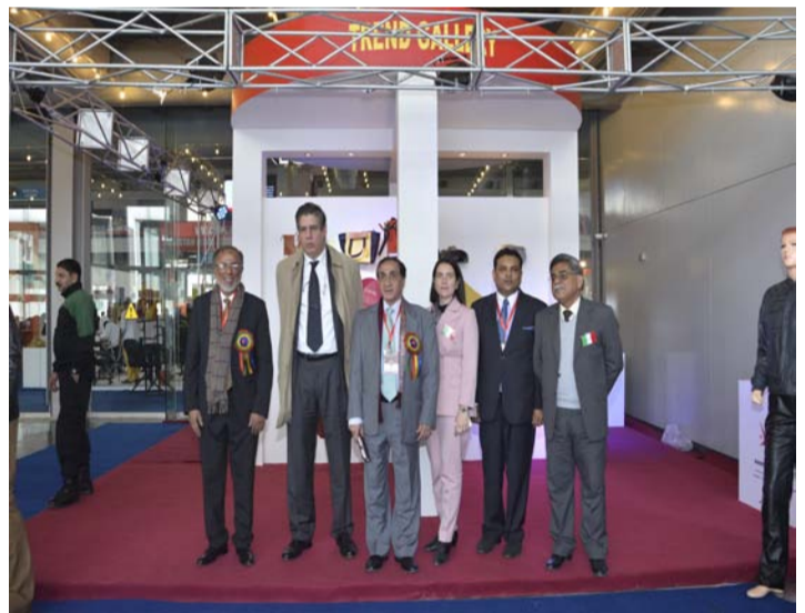
(A group photograph with H.E.The Ambassador of Italy in Pakistan on his visit to PMLS'16, Lahore)